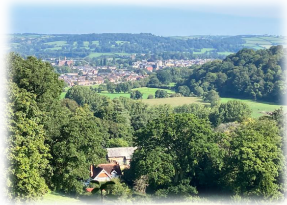
View of Tiverton from Garlands Lane, Ashley