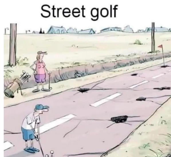
Coming to a Devon road near you...

The speaker secretary would welcome suggestions for guest speakers to give a talk at the monthly meeting. Any members with interesting experiences, careers or hobbies would be very welcome. Don't be shy!