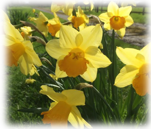
Spring Flowers – from the Gardens Group